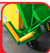
Table saw Extension